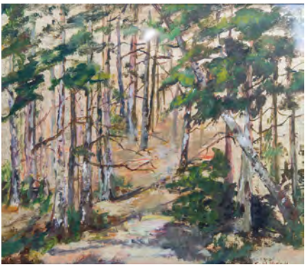
Painting to the left has been donated to the NAA from the Van Pelt family